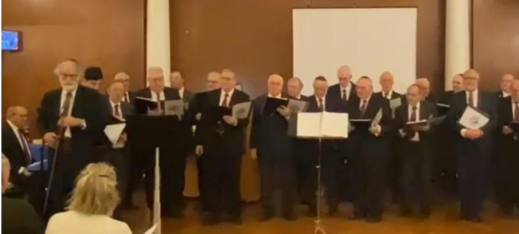
Tikva UK concert

On 24th November 2024 we took part in a concert at Kenton Shul raising funds for Tikva UK and on 10th December 2024 we provided the entertainment for a pre-Chanukah concert at Barclays Bank Canary Wharf.