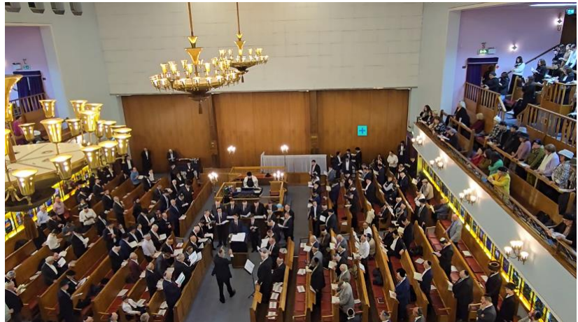
Our Selichot Service at Edgware Shul